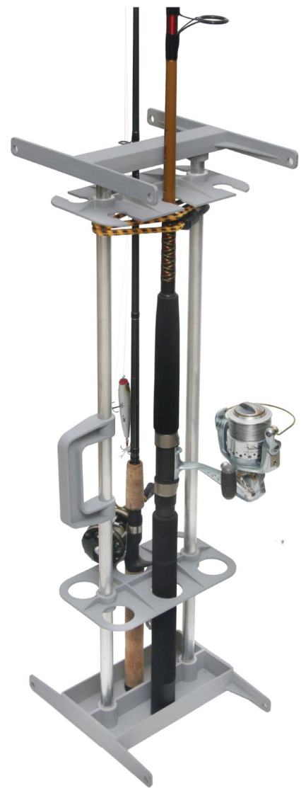
6 ROD CAPACITY