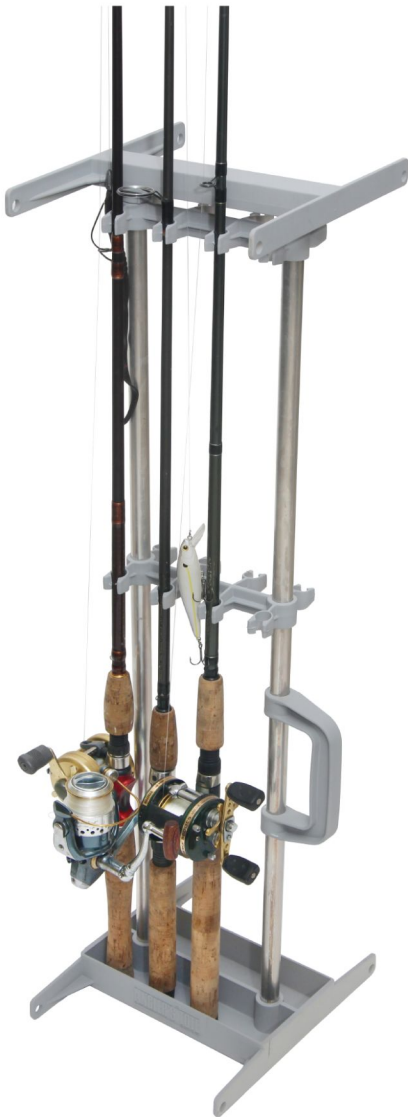
8 ROD CAPACITY